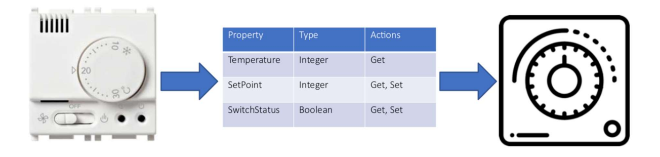
Figure 1 – Mapping a physical object to its digital twin

Using the example of the thermostat, in figure 1, defining its digital twin to map physical features to their virtual counterpart on Altior is a straightforward process: